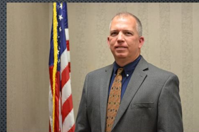
Lincoln Clark Berry Middle School