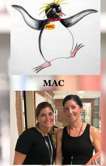
Gd. 3 Teachers: