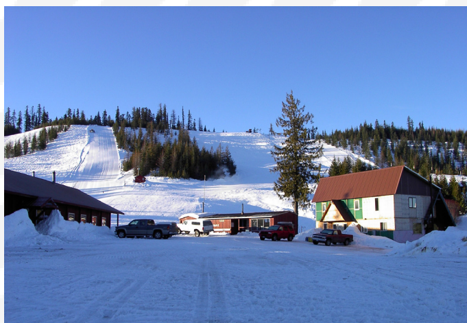
Bald Mountain Ski Area Pierce, Idaho