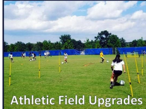
Athletic Field Upgrades