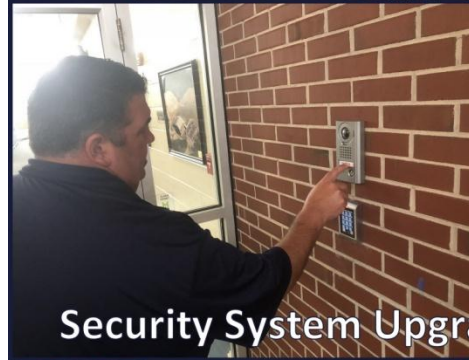
Security System Upgrades on Both Campuses