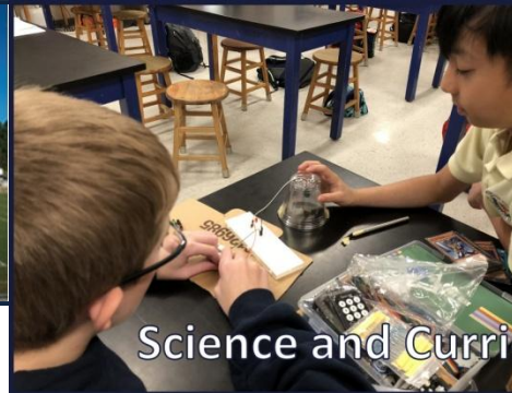
Science and Curriculum Enhancements