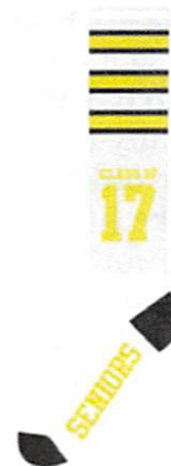
"CLASS OF 17" SPIRIT SOCKS Comes in all Packs and on line 43 Delivered at school on order day