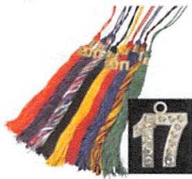
SOUVENIR TASSEL AND '17 BLING Comes in all packs and on line 37 Delivered at school on order day