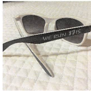
"WE RUN 17IS" SUNGLASSES Comes in all packs and on line 40 Delivered at school on order day