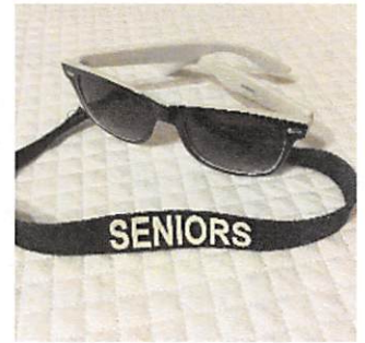
"SENIORS" CROAKIE Comes in all Packs and on line 40 Delivered at school on order day