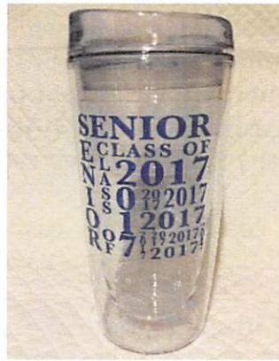
"SENIORS 2017" TUMBLER Available in all Packs and on line 39 Delivered at school on order day