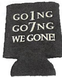
"GOING GO7NG WE GONE" KOOZIE Comes in all packs and on line 42 Delivered at school on order day