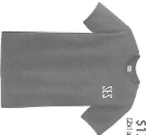
$12 Each (2nd and 3rd extra)