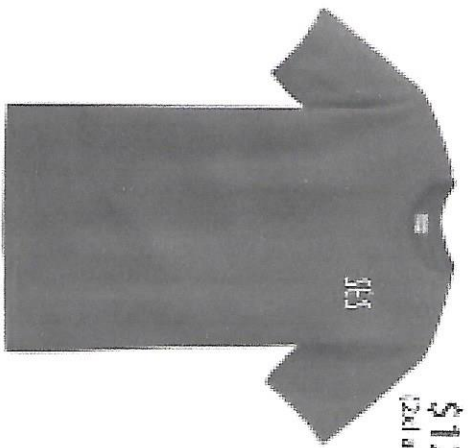
$12 Each (2nd and 3rd extra)