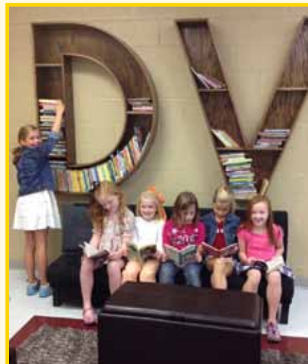
The Reading Lounge