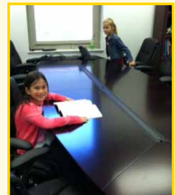
New Conference Room