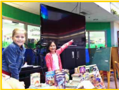
New Flat Screen in our Library

Your fundraising efforts bring improvements to our school. Our students and staff benefit from your help.