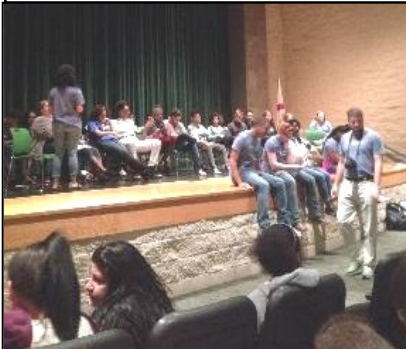
Panelists preparing for the assembly.