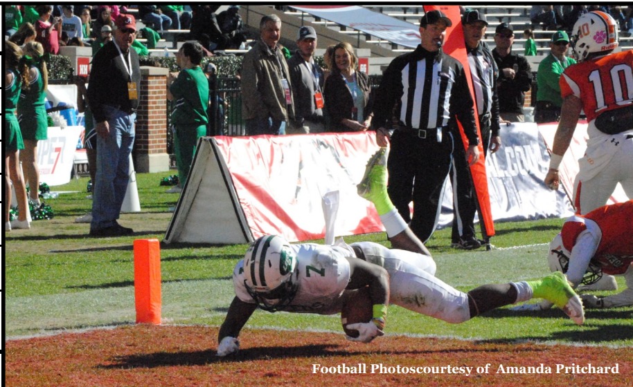
Football

The Vision of Leeds City Schools is Promoting Achievement, Respect, and Success.