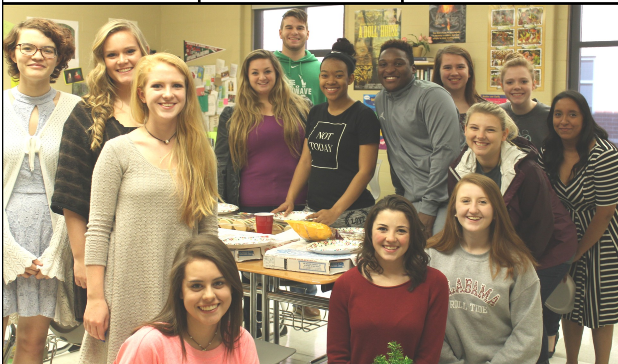
LHS Ambassadors celebrate holidays at last meeting of 2015

If your group is interested in pledging funds for the 2100 mile hike and the Scleroderma Foundation, please let Coach Hyde know.