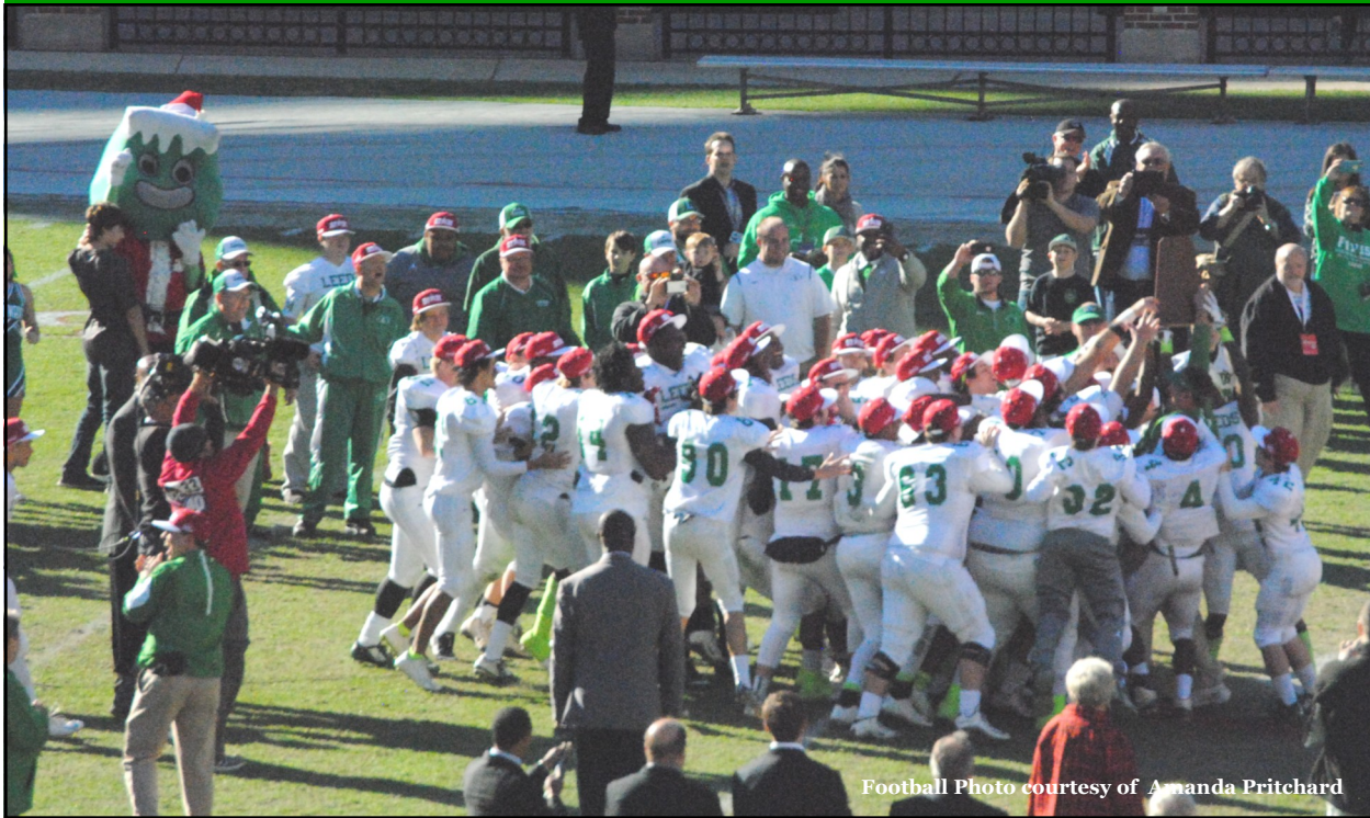
Football