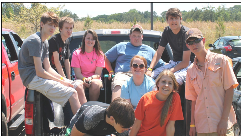
Hanging out with the "Hick Hop" gang.