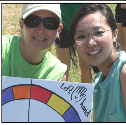
Math teachers play by the numbers.