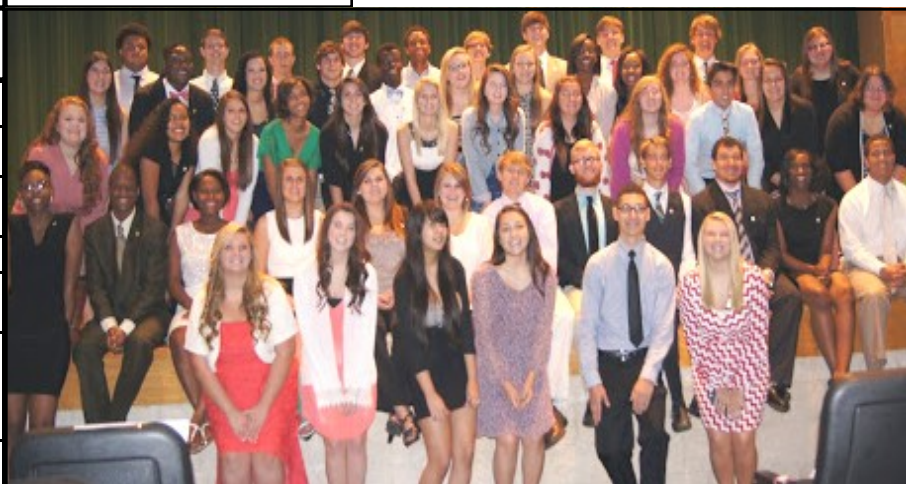
2014-15 LHS National Honor Society members

The Vision of Leeds City Schools is Promoting Achievement, Respect, and Success.