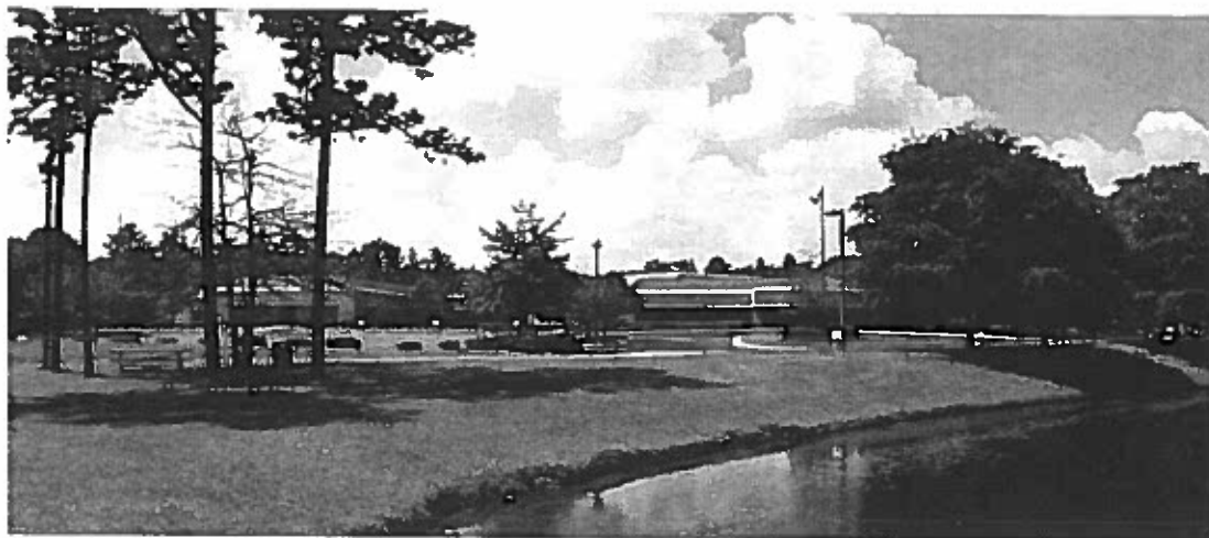
BayPointe Hospital, Mobile, Alabama

BayPointe Hospital opened its doors in 2002 as a free-standing psychiatric hospital serving the Mobile community and specializing in children's inpatient care. Located in west Mobile on a beautiful 15-