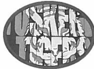
This is NOT the actual design. This shows how the artwork will look in front of the date.

Student Name: _____ Teacher's Name: _____