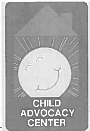
The Child Advocacy Center

The mission of the Child Advocacy Center (CAC) is to be the Mobile community response to the problem of child abuse. Abused children are interviewed here by a specialized, trained team of professionals. Children and their non-offending family members are referred for counseling and prepared for the criminal justice process. Also provided are educational and training programs in child abuse awareness and prevention. Phone: (251) 432-1101; Address: 1351 Springhill, Mobile, AL 36604; UWSWA Designation Code: 135; Website