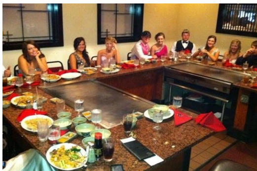
Gotta get that good food before prom night!