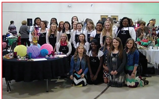
Students volunteered at First Free Will Baptist Church to hostess the Festival of Tables