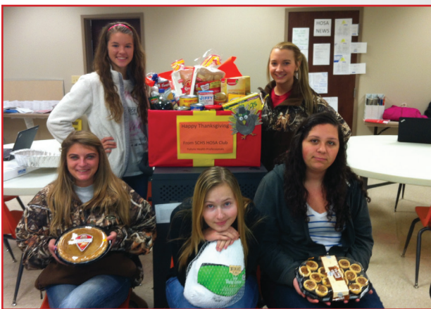
Thanksgiving donations by HOSA students