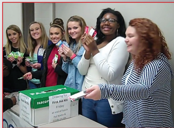
Students handed out health-related items during HOSA Week