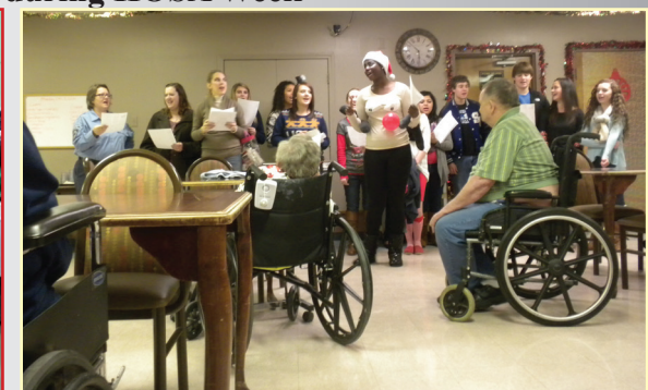
HOSA members go Caroling and hand out Christmas cards signed by the membership at local nursing homes