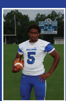
L.J. Shelton Bank of Star City Offensive