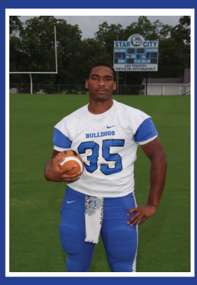
Cody Hampton Gardner Nursing Center Defensive