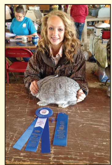
opposite Sex with her rabbit