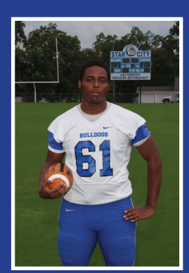
C. J. Everett Gardner Nursing Center Defensive