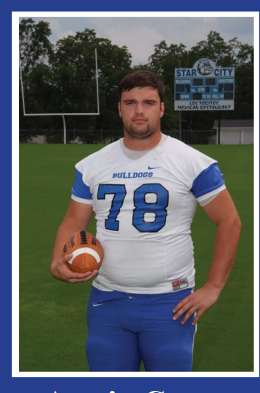
Austin Capps Gardner Nursing Center Defensive