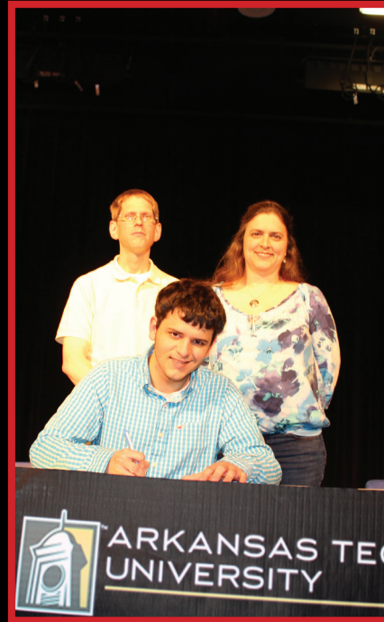
Bradley Diffie Distinguished Scholarship-$36,000