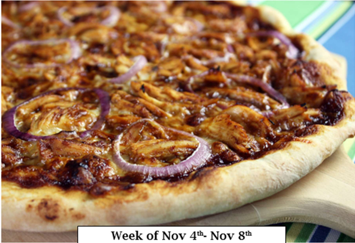
Week of Nov 4 th - Nov 8 th