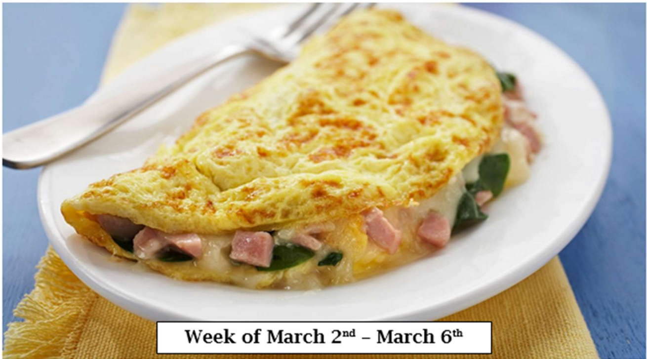
Week of March 2 nd – March 6 th