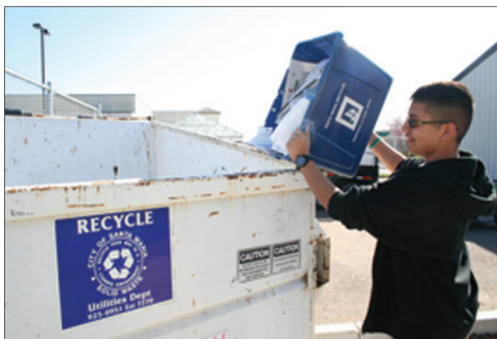
PVHS student completes act of kindness #11.

Humans are naturally drawn to the inner goodness of others, and letting that inner shine of goodness is exactly what this world needs the most. People today are so wrapped up in their own problems or pains. But one of the best pleasures of this earth is making someone else's day a bit better.