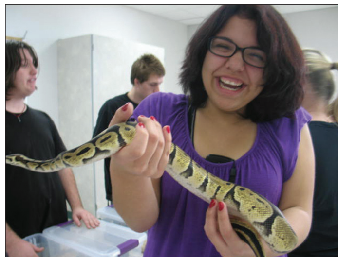
Author holding a pregnant snake.

This group showed everyone how kind our scaly friends can actually be.