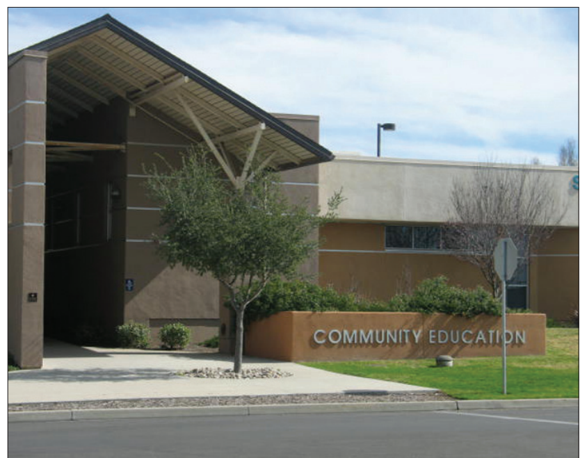
Where most students see themselves in the future.

As you can see, students have different plans for what will happen after high school. Don't feel bad if you don't know what to expect, because things always change. Whatever you expect to happen is never what will happen.