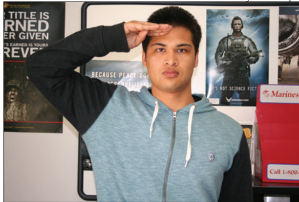
A Panther who already has his mind set for his future.

Aside from friends being recruited into the