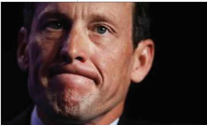
Lies always catch you at the finish line.

It’s unfortunate that many people participate in the use of these drugs; all they do is lie and cheat to everyone around them.