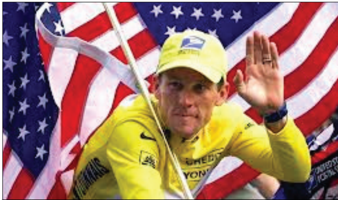
Lance Armstrong during the glory daze.