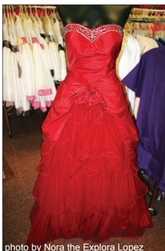
The dress plays a key role. birthday celebrant has a court of 18 pre-selected friends, usually 9