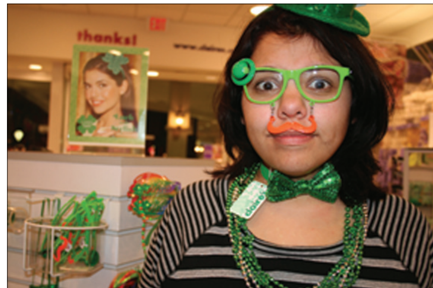
Dont mess with this leprechauns pot o'gold.