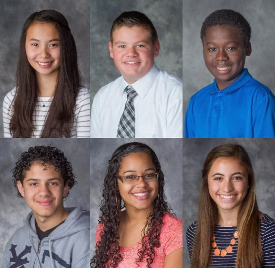
A few of our amazing sophomore students!

GROTON, CT - This Wednesday, all freshman, sophomore, and junior students will have their pictures taken first thing in the morning upon arrival. Three photographers from Steady Photography located in Branford, CT will be on campus from 6:30 am until the end of the day.