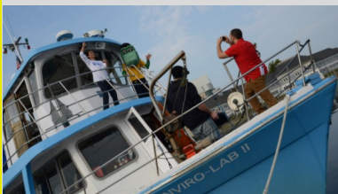
Filming of the 2013 Lip Dub at Project O.

GROTON, CT - This week will be the first round of boat trips for freshmen, sophomore, and Field Research students. Beginning on Thursday, students will be boarding busses to Avery Point where they will experience the Project O's Enviro-lab Boat.