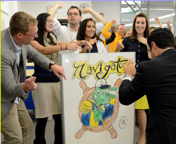
The teachers of MSMHS take part in the 2014 Lip Dub

GROTON, CT - There is no other day like it. Every October 1st at the Marine Science Magnet High School is the filming of the Lip Dub. The Lip Dub is a spirit filled celebration of MSMHS pride that is caught on video for all parents, students, staff, community and future students to view.