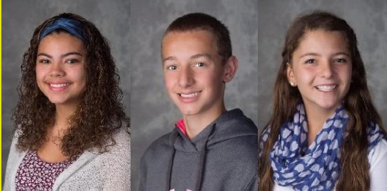
A few of our amazing sophomore students!