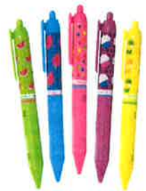
Scented Gel Crayons