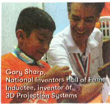
Gary Sharp, National Inventors Hall of Fame Inductee, inventor of 3D Projection Systems