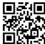
List 1 QR Code

Download Adobe Spark on your tablet or phone (it's FREE) and have your child practice their sight words with the video.