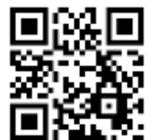
List 2 QR Code