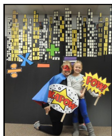
"Superhero Math" Title I Family Night