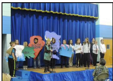
"Social Studies Live!" Title I Family Night