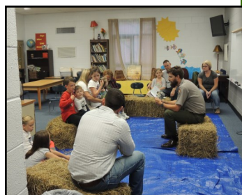
"Camp Out With Literacy" Title I Family Night