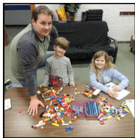
"LEGO Math" Title I Family Night