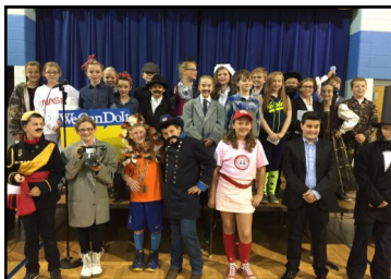
"Social Studies Live!" Title I Family Night