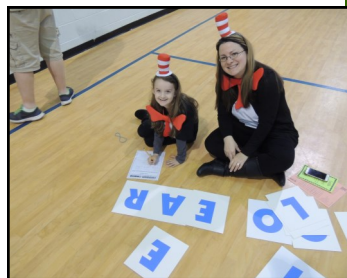
"Dr. Seuss Literacy Day" Title I Family Event