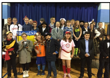
"Social Studies Live!"