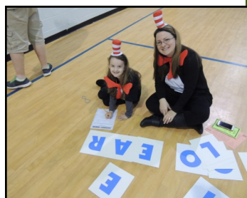
"Dr. Seuss Literacy Day"