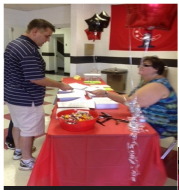
Compact input from parent at open house

Where is it available? The plan is available at <u>all</u> parent meetings and at Ims.catoosa.k12.ga.us. Parents can also get a copy of the plan in the Family Resource Center.