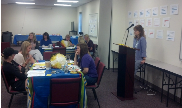
Members of the District Advisory Council incorporate information from annual evaluation graphs and parent comments.