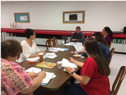
Parent Advisory Councils discuss Title I budgets and collect input from parents and families.

The Catoosa County School District will reserve at least 1 percent from the total amount of Title I funds it receives in FY18 to carry out the parent and family engagement requirements listed in this policy and as described in Section 1116 of the ESSA. The Catoosa County School District will distribute at least 90 percent of that 1% to Title I schools to support their local-level parent and family engagement programs and activities. The district will provide clear guidance and communication to assist each Title I school in developing an adequate parent and family engagement budget that addresses their needs assessment and parent recommendations.