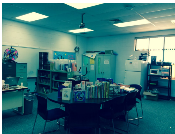
Parent Resource Center