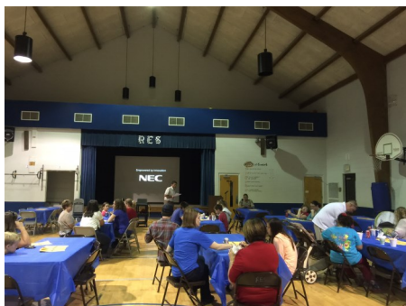
Title I Annual Meeting

In the life of a child, there are many teachers but none more important than parents. Research tells us that parent involvement makes a big difference. When schools welcome families, establish personal relationships among families and staff, help parents understand how the system works, and encourage family-staff collaboration to improve student achievement, students do better.