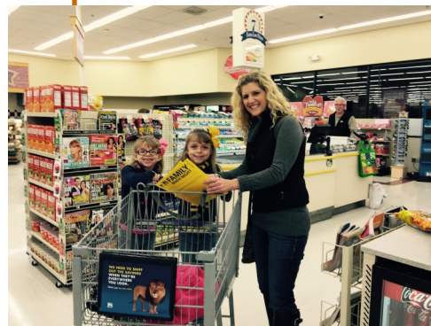
RES Math Night at Food Lion