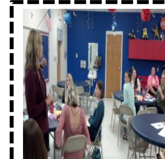
Parents approving the Family- School Compact at a PAC Meeting