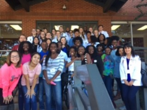
Left: GA PCOM mentors and mentees.

Medical & Healthcare Sciences held a celebration kick-off luncheon with the Junior /Ga Philadelphia College of Osteopathic Medicine students and their mentors. The program detailed the second year activities that will focus on the importance of Community Public Health and its relevancy to infectious disease and prevention. Several of the students participated in public speaking classes which provided a greater level of confidence in their leadership skills.