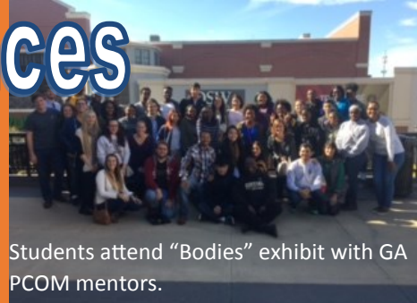
Students attend "Bodies" exhibit with GA PCOM mentors.

This year's theme is, 'Launching New Dimensions" HC 2017! The conference will examine the five standard career pathways and processes that are necessary to launch new ideas of technology and innovation in the healthcare arena. A large number of students are expected to participate from all seven of the GCPS Academies, where expert speakers from across the state will facilitate these sessions. Community partners, vendors and universities will also play a significant role in the conference.