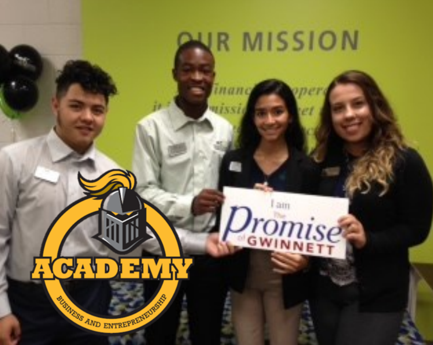
Above: CGHS student interns run the Peach State FCU