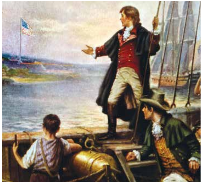
In “The Star-Spangled Banner,” by Percy Moran, Francis Scott Key reaches toward the flag flying over Fort McHenry.

Many Americans celebrate national or federal holidays. These holidays often honor people or events in our American heritage. These holidays are “national” in a legal sense only for federal institutions and in the District of Columbia. Typically, federal offices are closed on these holidays. Each state can decide whether or not to celebrate the holiday. Businesses, schools, and commercial establishments may choose whether or not to close on these days. Since 1971, federal holidays are observed on Mondays except for New Year’s Day, Independence Day, Veterans Day, Thanksgiving, and Christmas.