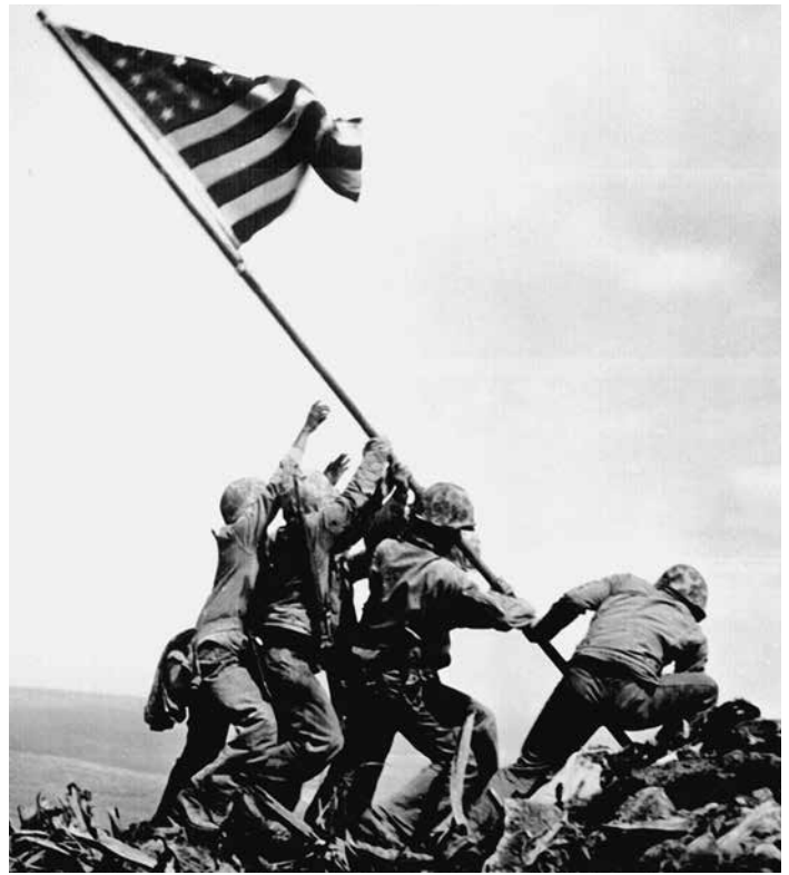
“Raising the Flag on Iwo Jima,”

From 1959 to 1975, United States Armed Forces and the South Vietnamese Army fought against the North Vietnamese in the Vietnam War. The United States supported the democratic government in the south of the country to help it resist pressure from the communist north. The war ended in 1975 with the fall of Saigon, the capital of South Vietnam. In 1976,