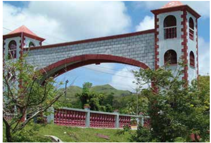
Old Spanish Bridge in Umatac, Guam.

The northern border of the United States stretches more than 5,000 miles from Maine in the East to Alaska in the West. There are 13 states on the border with Canada. The Treaty of Paris of 1783 established the official boundary between Canada and the United States after the Revolutionary War. Since that time, there have been land disputes, but they have been resolved through treaties. The International Boundary Commission, which is headed by two commissioners, one American and one Canadian, is responsible for maintaining the boundary.