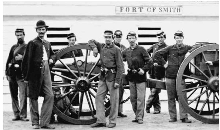
Civil War soldiers with cannon and caisson, Fort C.F. Smith, Co. L, 2d New York Artillery.

The American Civil War is also known as the War between the States. It was a war between the people in the northern states and those in the southern