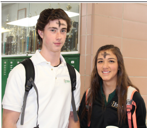
Ash Wednesday was celebrated at HCP on February 14. Students pose for a picture after receiving ashes at Mass.