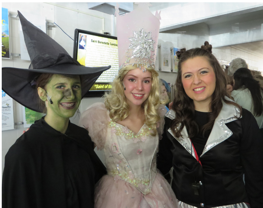
HCP students did a remarkable job with the Wizard of OZ musical in March!