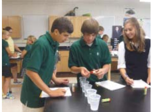
Students in Science Lab

Thank you, in advance, for considering this request. More importantly, please don't be strangers. We would love to see all of you return to Hackett Catholic Central and see the great things we have going.