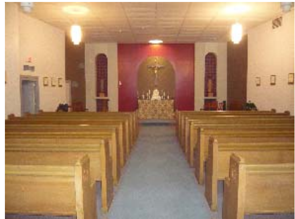
The Chapel gets a facelift