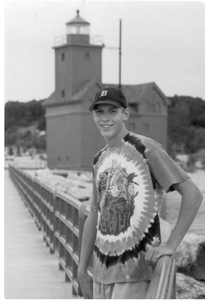
No! Wrong background. Too far away.