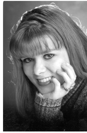
No! Absolutely no hands to face. Too close.