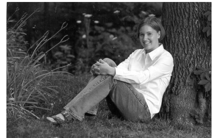
No! Wrong pose. Wrong background. Wrong orientation.