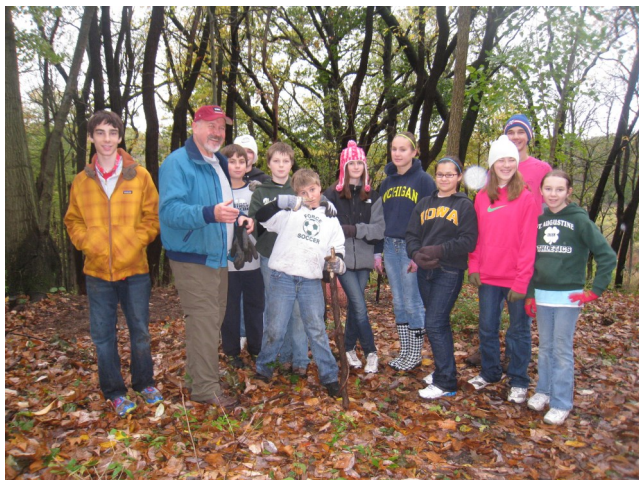
Summary Report of CST survey 2010–2012