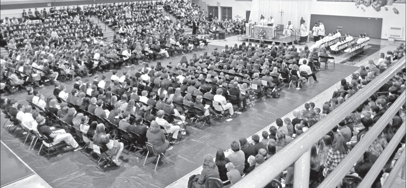
More than 1,000 Catholic school students, faculty and staff attended the Catholic Schools Week Mass on Wednesday, Jan. 28, in Hackett Catholic Prep gym in Kalamazoo.

The special week began Sunday, Jan. 25, and ended Saturday, Jan. 31, in Catholic schools across the nation.