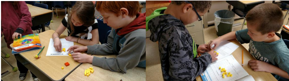
Third graders are discovering area of different objects using different manipulates. Students love doing explorations in our math series. (Ferguson)