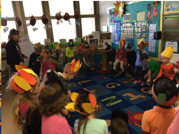
Learning the Thanksgiving Story!!