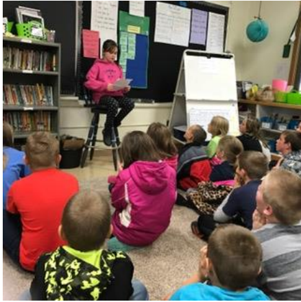
Students delivered a speech to try to earn a spot as our student council representative. (Powell)