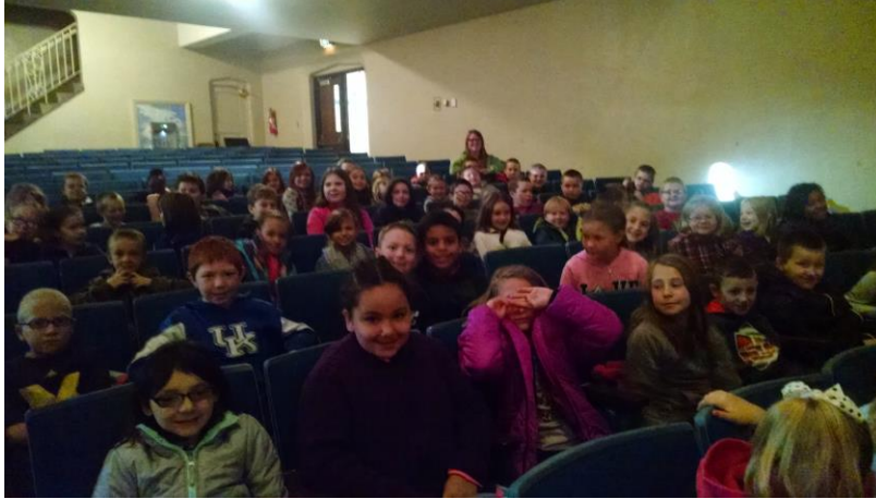
3 rd grade students enjoying the "Chicken Dance" at OMS.