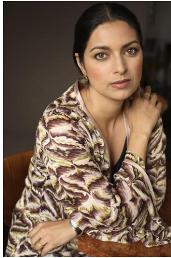
Jhumpa Lahiri.