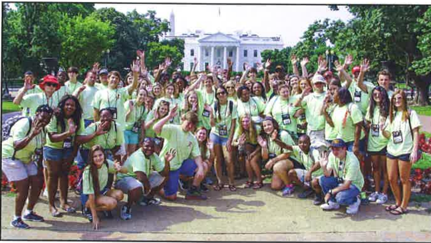
Sightseeing in Washington, D.C., included a stop at the White House for these 2017 Youth Tour participants.

Each year Mississippi's student delegation joins more than 1,800 high school juniors from 44 states across the nation at the Youth Tour in Washington, D.C., where they learn about cooperatives and rural electrification from a national perspective.