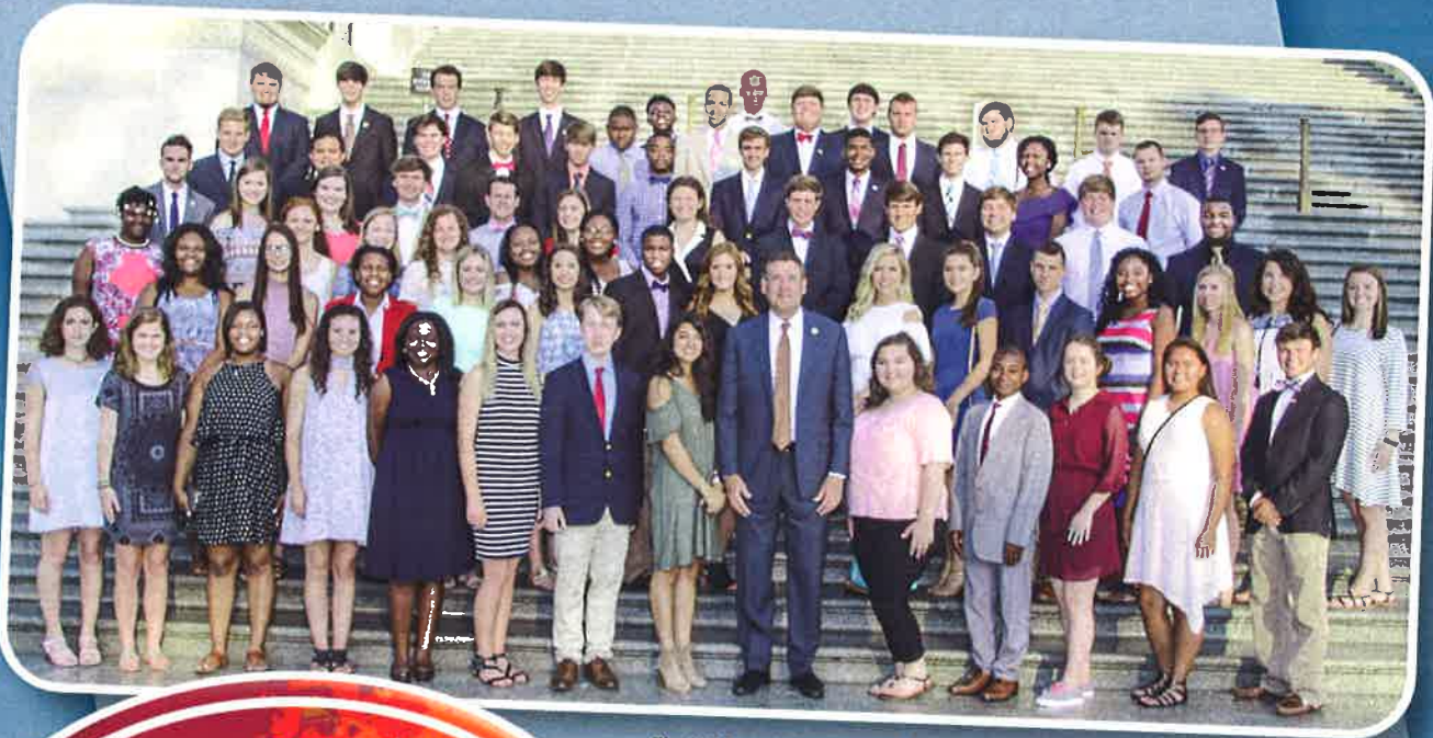
The 2017 participants with Rep. Gregg Harper.