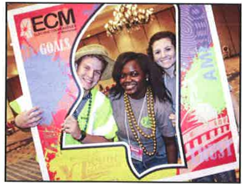
Fun time at the workshop includes an ice cream social and photobooth time.

At the 2017 workshop, students heard presentations from Gov. Phil Bryant and Lt. Gov. Tate Reeves, as well as motivational speakers, and discussed issues in a mock town hall meeting. By participating in a fun team-building exercise conducted by a team of professional instructors, students gained unique insight into the value of working with others to achieve common goals.