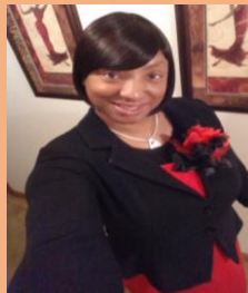
Mrs. Sandra Lakes Computer Lab