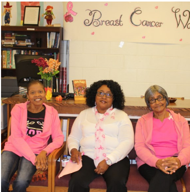
Breast Cancer Awareness