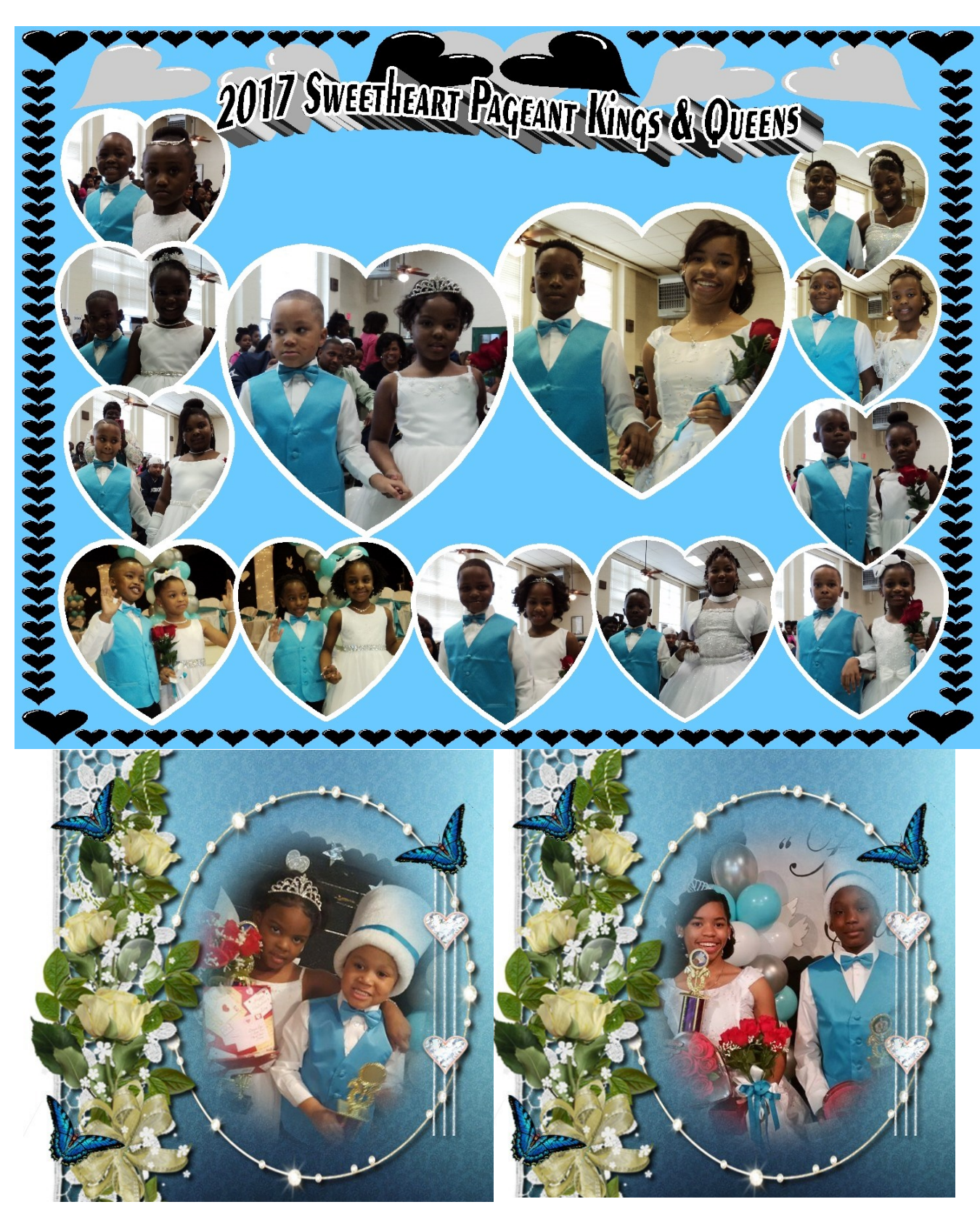
2017 Sweetheart Pageant Winners