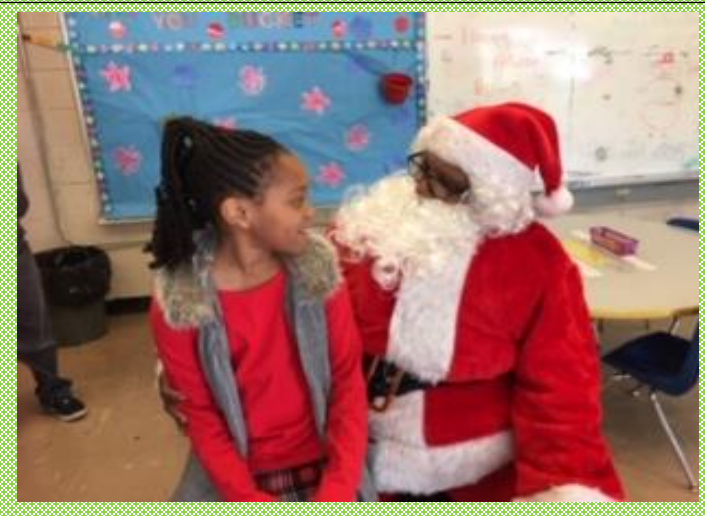
Celebrating the Season!