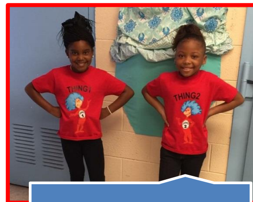
Thing 1 & Thing 2